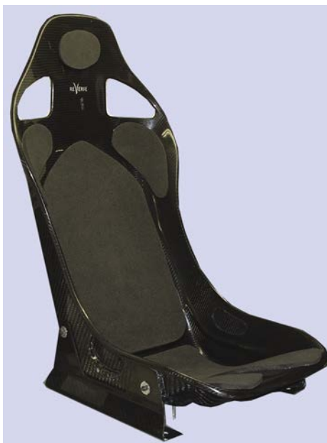
Mulsanne B shown with side mount subframe Also shown with R01 SI0007 seat cushion trim kit.