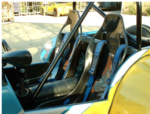
Mulsanne C in Dax Rush on side mount frames

When fitting, please ensure where the seats bolt to the chassis or floor pan is suitably reinforced back to the main chassis members to provide adequate strength. Bolting through a 1 or 1.5mm alloy/ steel floor simply will not be safe or comply with SVA / MOT requirements. When using rigid side mounts ensure that the bolt protrudes 8mm into the seat and no further as you could damage the seat, use the four m8*12 bolts and washers provided.