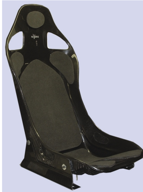
Mulsanne C shown with side mount subframe Also shown with R01SI0007 seat cushion trim kit.