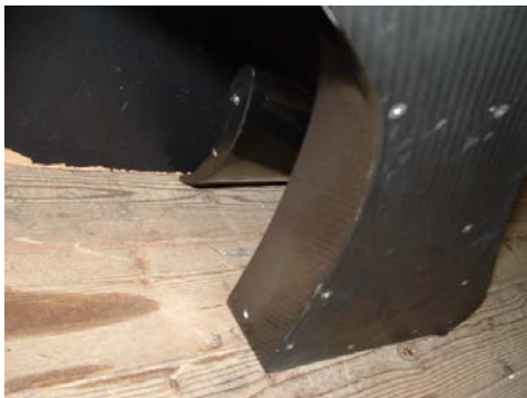
Upper wing ends need dressing back to fit curvature of body neatly.