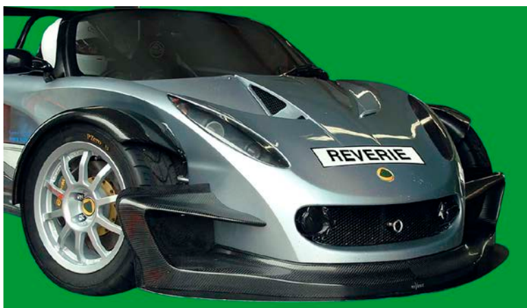
Deep 340r front spoiler shown with gurney flaps