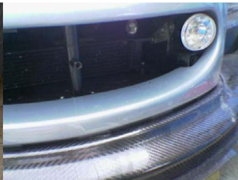
Front spoiler pulled up into position before Bolts tightened fully.