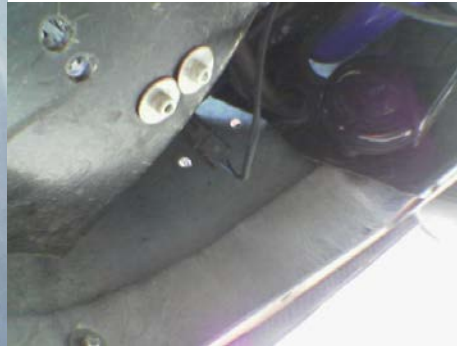
View from under car at upper wing holes