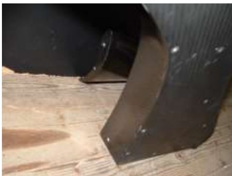
Upper wing ends need dressing back to fit curvature of body neatly.