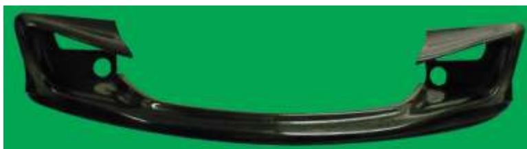
Std height 340r front spoiler shown with optional 58mm brake cooling snorkels fitted