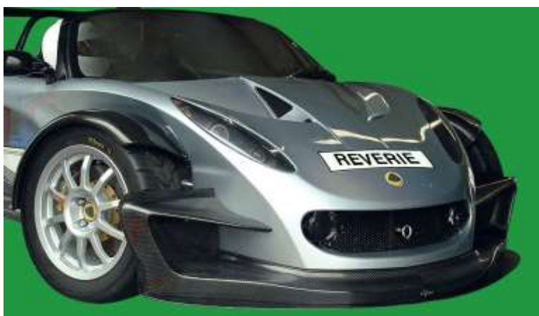
Deep 340r front spoiler shown with gurney flaps