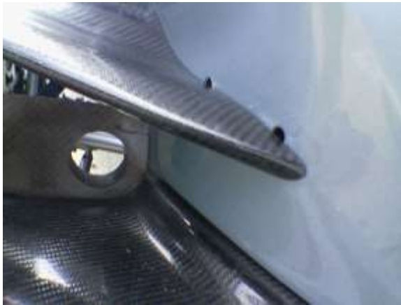
Showing front upper wings need lifting up 5mm