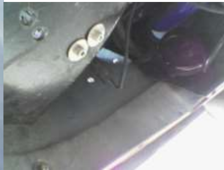
View from under car at upper wing holes