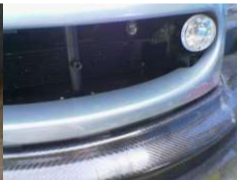
Front spoiler pulled up into position before Bolts tightened fully.

D. Once the upper wing ends fit nicely in position, they may need pulling up the body by 5mm to cover the holes ok. Then check all the holes in the body match the spoiler holes. All bolts needed are M6 thread. If any holes do not match, drill or enlarge holes. Fit new spoiler with large penny or mudguard style washers, get some one to hold spoiler up tight under front body lip whilst you tighten all bolts.