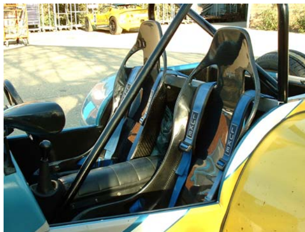
Mulsanne B in Dax Rush on side mount frames

When fitting, please ensure where the seats bolt to the chassis or floor pan is suitably reinforced back to the main chassis members to provide adequate strength. Bolting through a 1 or 1.5mm alloy/ steel floor simply will not be safe or comply with SVA / MOT requirements. When using rigid side mounts ensure that the bolt protrudes 8mm into the seat and no further as you could damage the seat, use the four m8*12 bolts and washers provided.