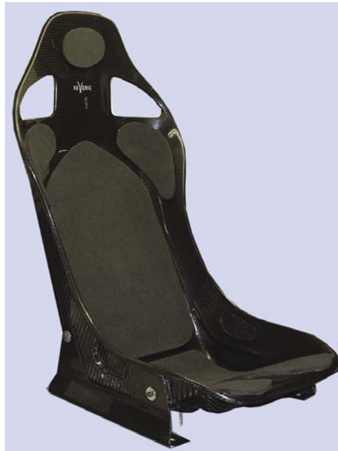
Mulsanne B shown with side mount subframe Also shown with R01SI0007 seat cushion trim kit.