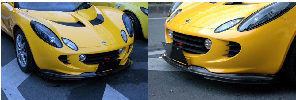
S2 spoiler fitted in position

THE SPOILER CAN NOW BE BOLTED TO THE FRONT CLAM WITH THE BOLT KIT PROVIDED, PLEASE NOTE THAT THE LARGER M6 WASHERS ARE USED ON THE INSIDE AGAINST THE CLAM WITH THE SMALLER M6 WASHERS ON THE OUTSIDE AGAINST THE CARBON SPOILER AS SHOWN.