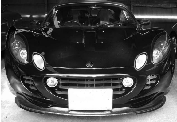
SPOILER WITH ADDITIONAL SPLITTER EXTENSIONS NOT FOR HIGHWAY USE