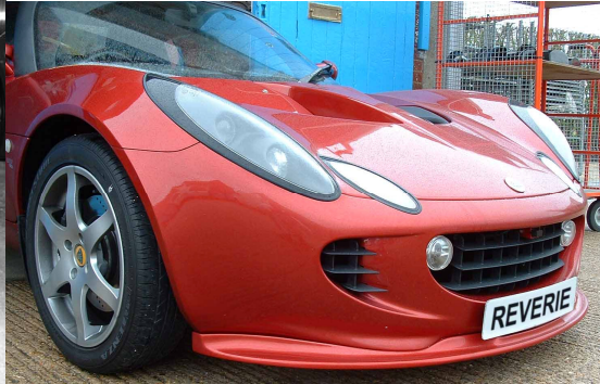
BASIC SPOILER PAINTED